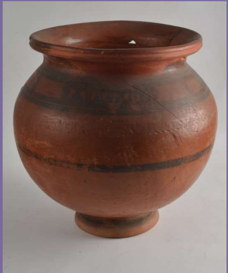
2. To store food