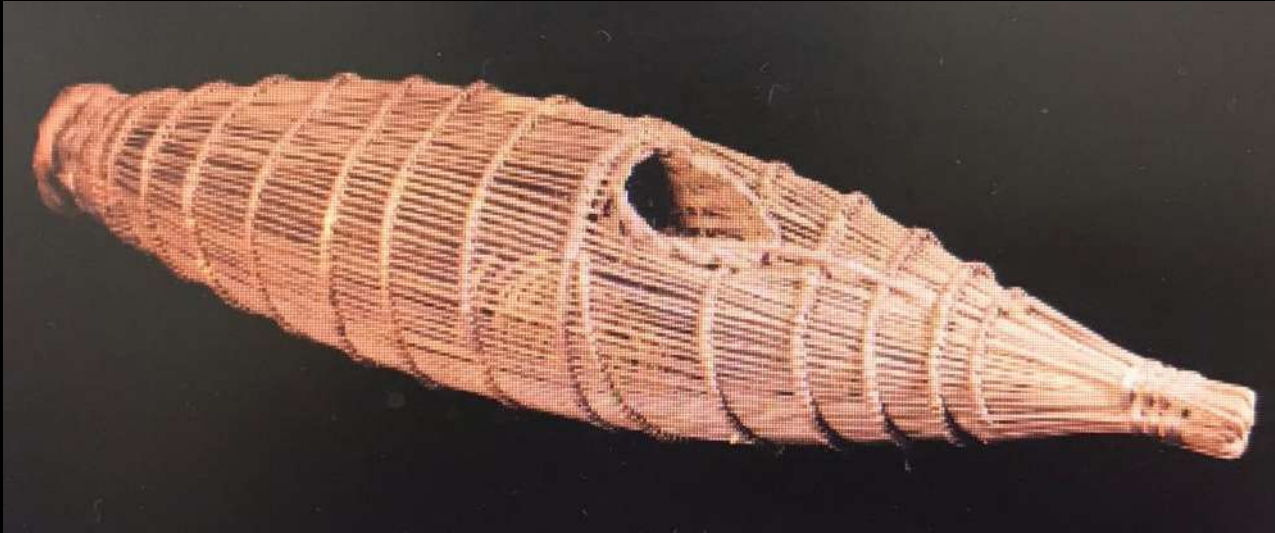
Kabow loo, a fish trap from M A _ I _ _ _