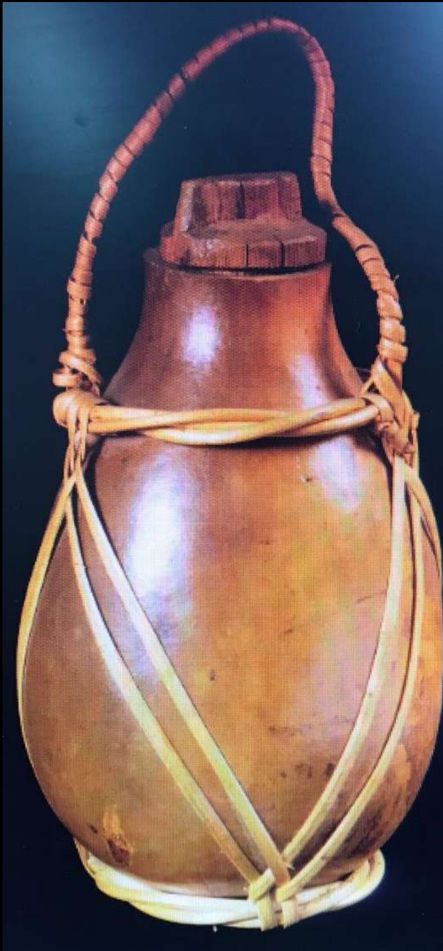
A guard container from M _ _ O _ _ M