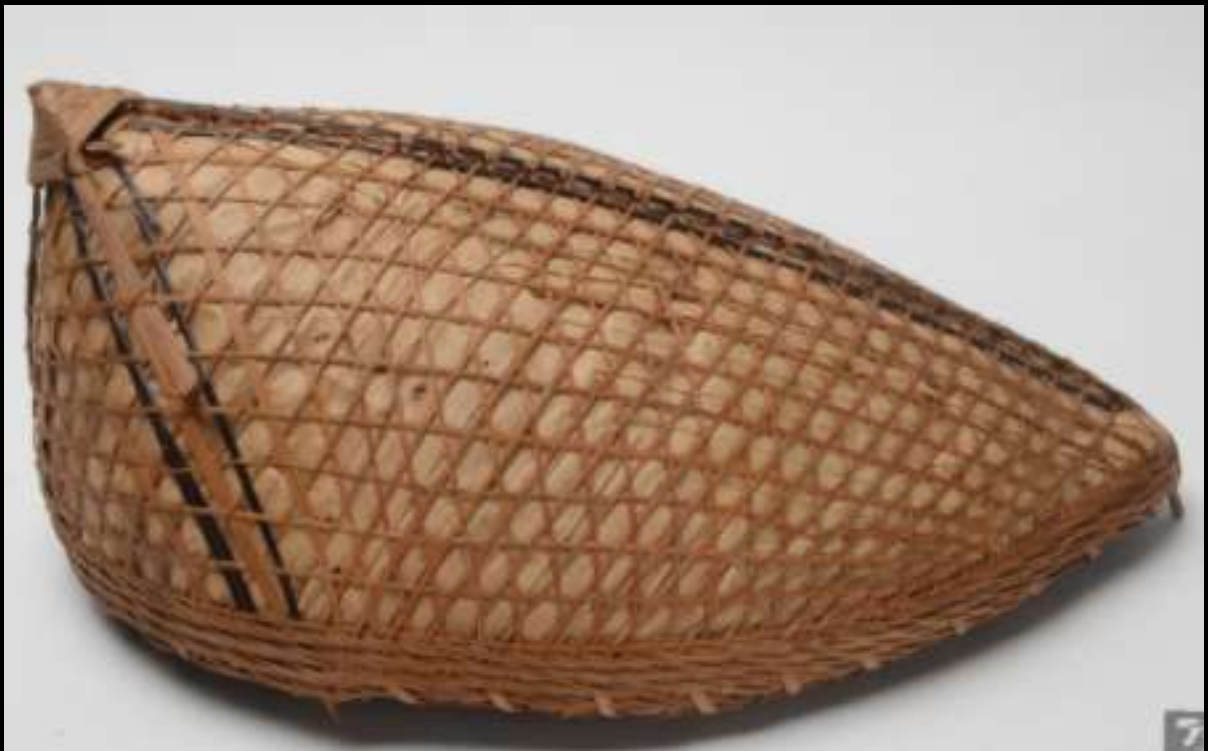
Knup, a Rain Shield from M _ G _ _ L _ Y _