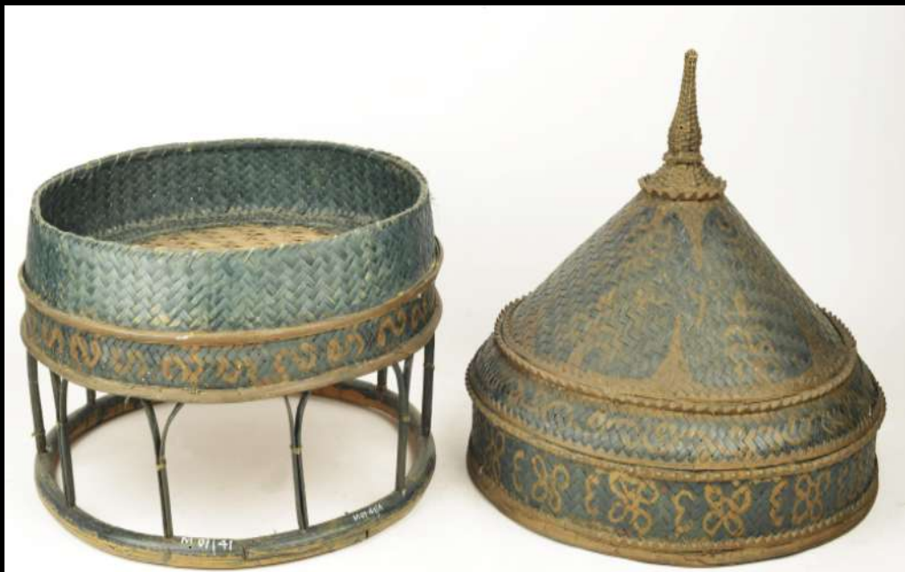
A Basket (Phen) from