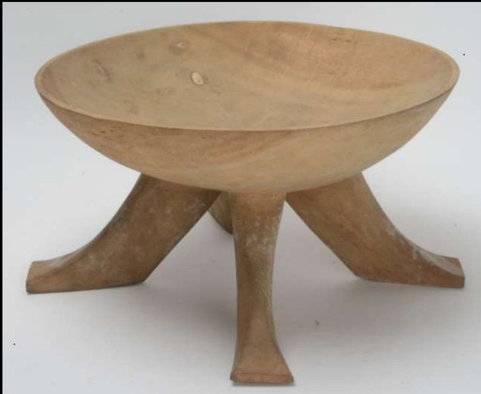
Khupi, a wooden plate from N A _ _ L _ _ D