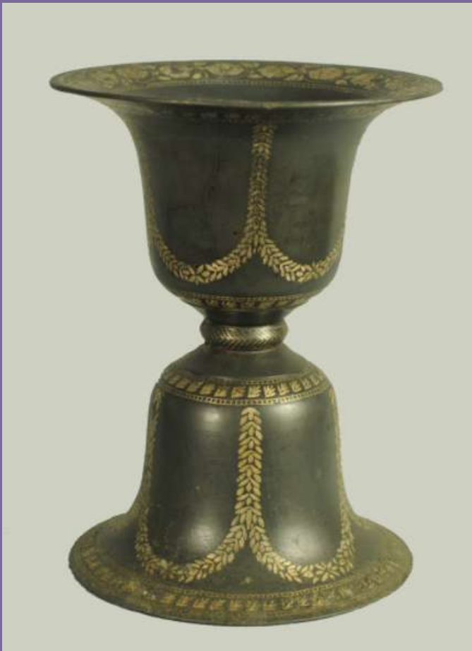
1. Made for Spitting into

Here is table of National Museum artefacts that is associated with cleanliness. Re-arrange the jumble words and find your answers in the puzzle