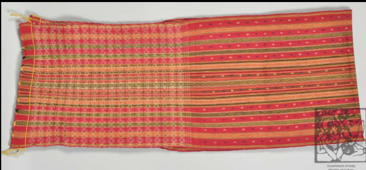
Risa, a woven cloth with multiple uses from T R I _ _ _ _