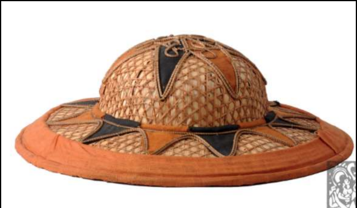
Japi, a conical hat from A S _ _ _